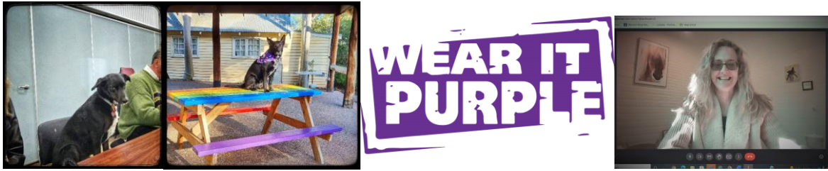
Side-eye when forced to attend staff meetings/Dug the Dog Wears it Purple.