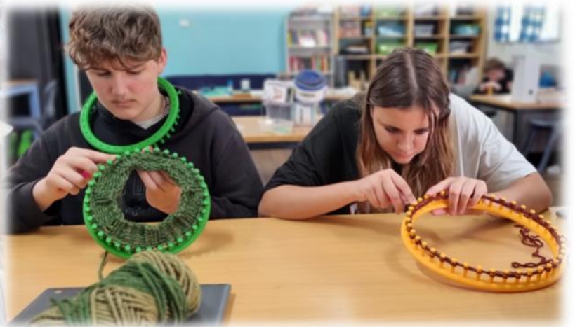
Developing a new skill